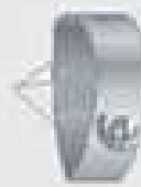
Three-Sided Curve (OD)